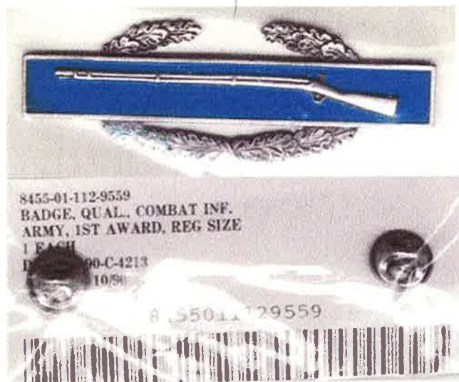
Combat Infantry Badge