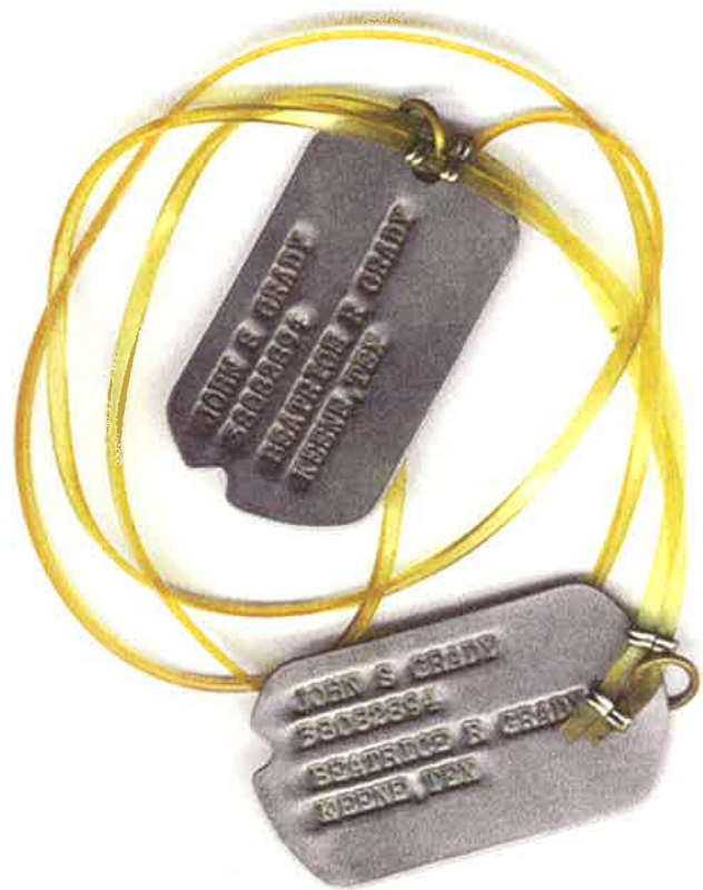
Enlisted Dog Tags