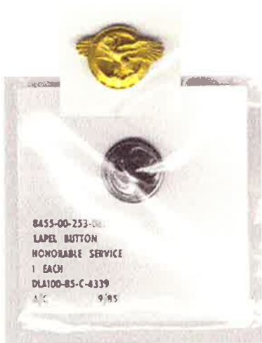
Honorable Service (Good Conduct) Lapel Pin