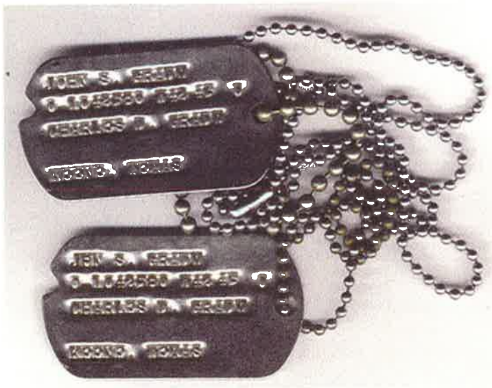
Officer Dog Tags