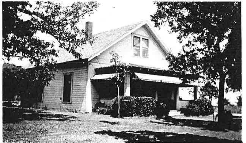
Home at NE corner of Eastern and Pecan Streets, Keene, Texas, Year 1942.