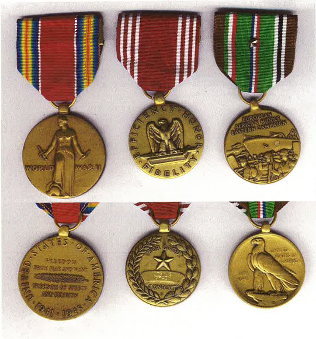
World War II